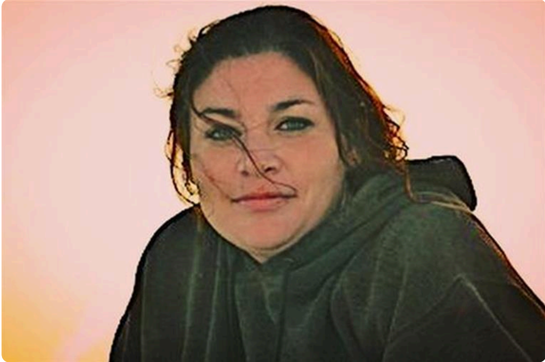
Daytona Beach 2012